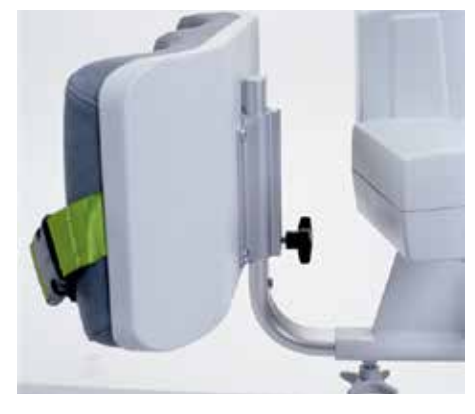
Adjustable lower leg support

A soft-padded lower leg support distributes the pressure comfortably and evenly with adjustable height and depth.