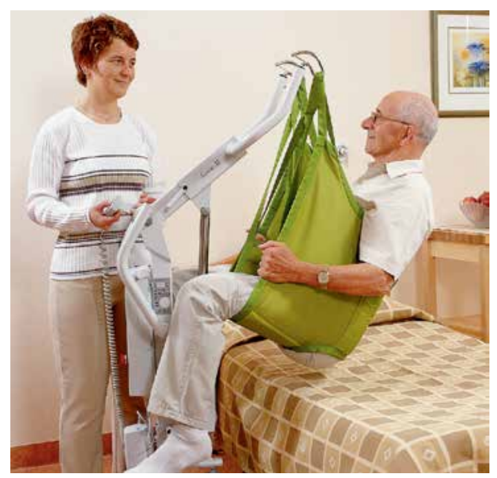
Sabina® II lift for seated lifts, pictured here with Liko® Original Sling Mod. 10.

The Sabina<sup>®</sup> II lift is different from other sit-to-stand lifts. Cleverly designed accessories enable a greater range of possibilities.