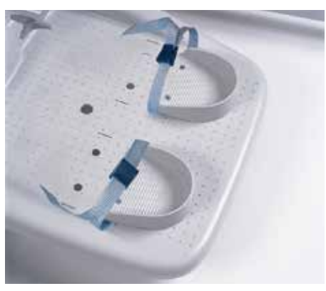
Optional heel supports with straps

Practical color coding of sizes helps match the correct lift accessories.