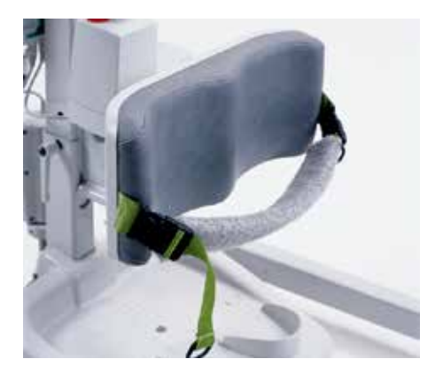
Secure calf strap

A soft-padded lower leg support distributes the pressure comfortably and evenly with adjustable height and depth.