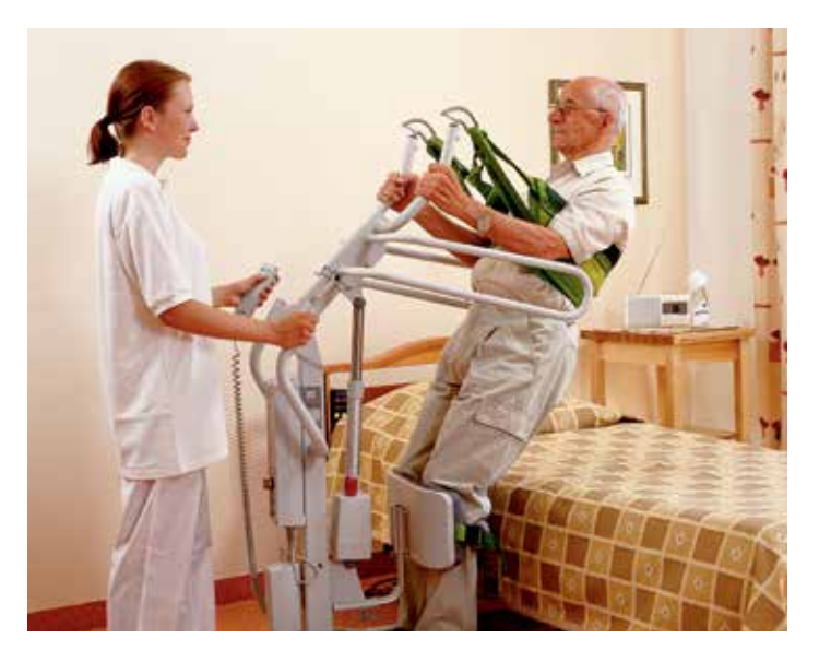
The Sabina ^{\circ} II lift with Side Support and SafetyVest ^{\rm TM} sling.

The Sabina<sup>®</sup> II lift is not simply a sit-to-stand lift; it is a bridge between active and passive periods in the everyday life of the patient. During an active period, the Sabina<sup>®</sup> II lift can be parked out of the way, ready for use when the patient needs extra support during periods of reduced mobility. The Sabina<sup>®</sup> II lift is also perfect for static weight bearing, which strengthens the skeleton and stimulates the circulatory system.