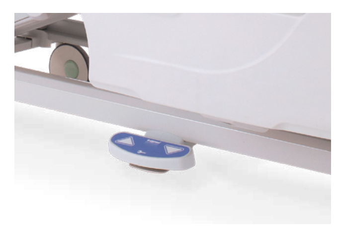
Optional bilateral high-low foot control with automatic lock-out and 5th steering castor