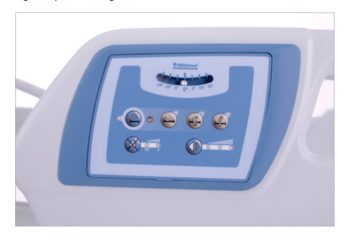
3-Mode Bed Exit Alarm