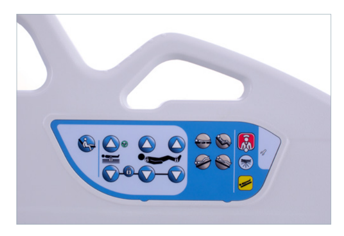
Low height indicator and One-Touch Side Egress positioning