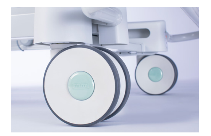
Optional 125 mm double band castors**